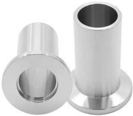
LONG STUB END