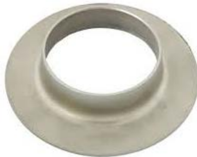
SHORT STUB END