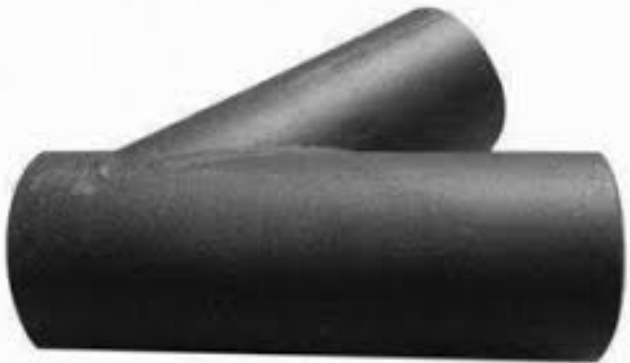
EQUAL LATERAL TEE